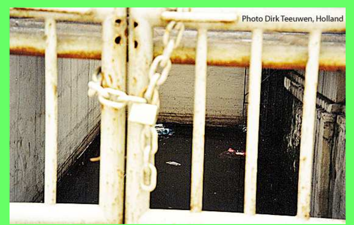
3. Interior of the platform dungeons Photo Dirk Teeuwen Holland, 2006